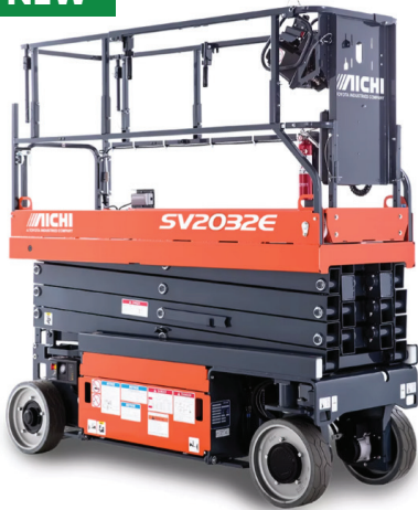
2023 AICHI SV2032E E-Series Scissor Lift