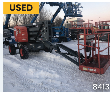
2015 SKYJACK SJ46AJ Articulating Boom Lift