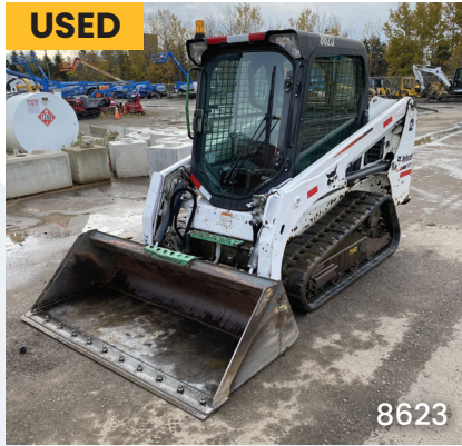
2017 T450T4 BOBCAT Compact Track Loader