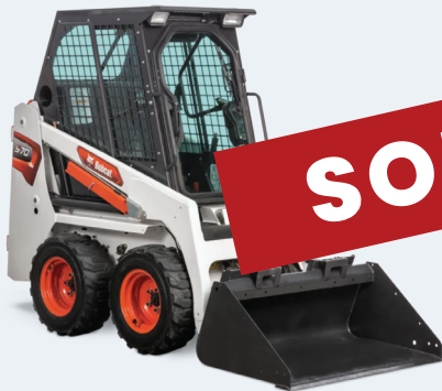
2023 BOBCAT S70 Compact Skid Steer