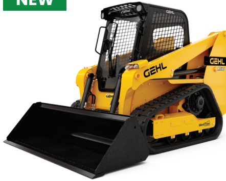
2023 GEHL RT165 Compact Track Loader