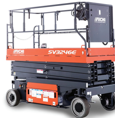
2023 AICHI SV3246E E-Series Scissor Lift