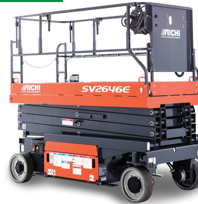
2023 AICHI SV2646E E-Series Scissor Lift