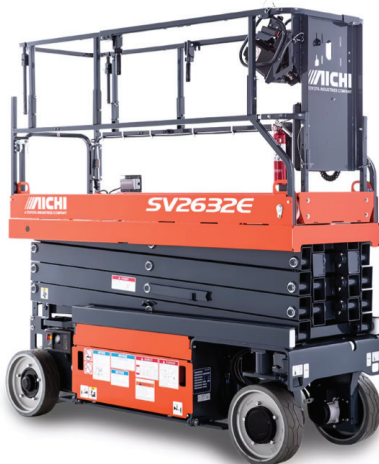
2023 AICHI SV2632E E-Series Scissor Lift