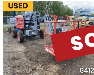
2015 SKYJACK SJ46AJ Articulating Boom Lift