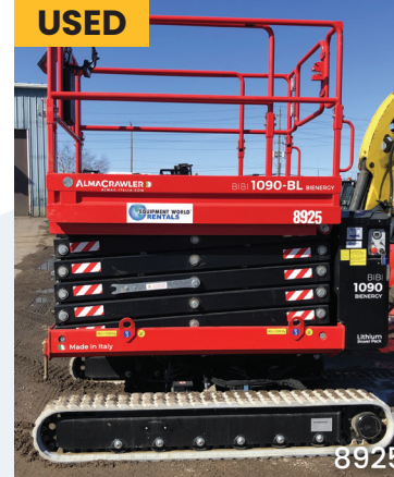
2020 ALMAC BIBI 1090 - BL BIENERGY Rough-Terrain Scissor Lift