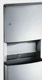
PAPER TOWEL COMBINATION UNITS