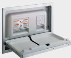
BABY CHANGING STATIONS