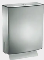
PAPER TOWEL DISPENSERS